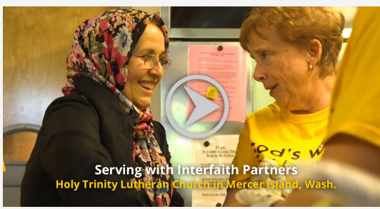
Serving with Interfaith Partners Holy Trinity Lutheran Church in Mercer Island, Wash.