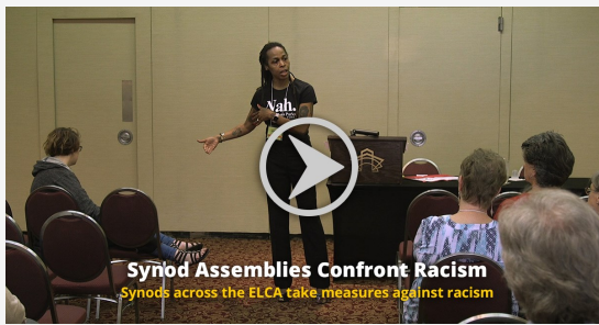
Synod Assemblies Confront Racism Synods across the ELCA take measures against racism