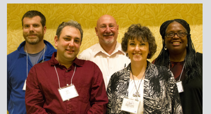
Need help with mission planning? Meet the directors for evangelical mission!