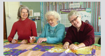
Check out this new year-round guide to stewardship: Stewards of God's Love.