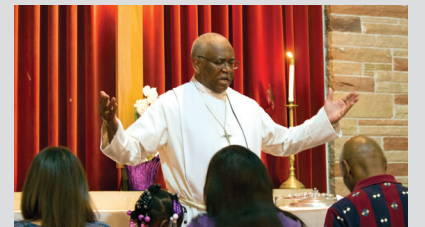
Rehearsing for mission in worship.