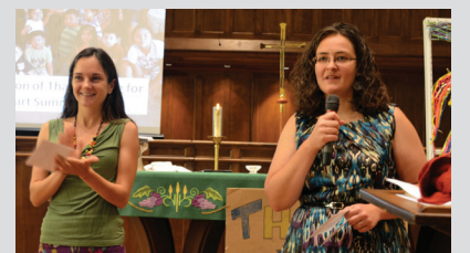
Young adults and the spiritual discipline of listening.