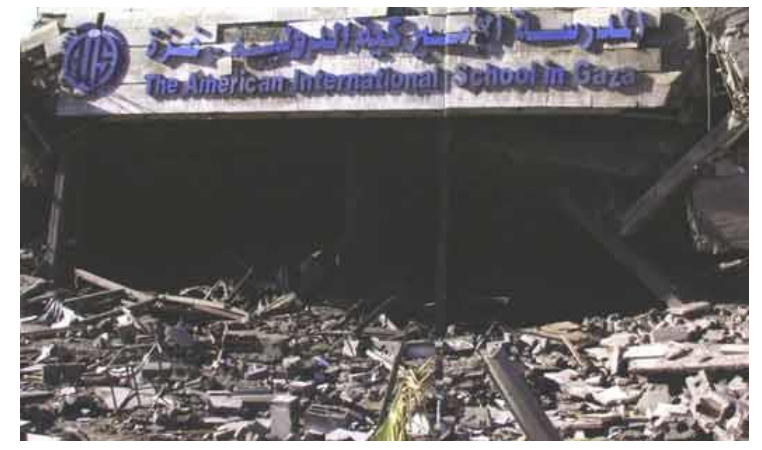
The American International School in Gaza was one of 312 schools and university buildings destroyed or damaged in Operation Cast Lead.

Gaza is an area of land three to eight miles wide and less than 30 miles long (slightly more than twice the size of Washington, D.C.), with 1.6 million people, on the southwestern coast of Israel/Palestine. Many call it the largest open-air prison in the world. The flow of people and goods has been under a blockade for years; the blockade was intensified after Hamas took control of the area following the