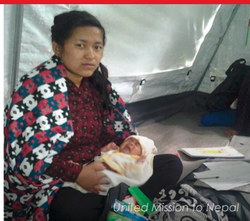
United Mission to Nepal

After six months, the immediate response phase is winding down; Lutheran Disaster Response is now dedicated to long-term recovery in Nepal. Together with our partners, we are planning to help affected communities “build back better.” This will include rebuilding damaged homes and water and sanitation structures, while also empowering communities and meeting critical livelihood needs. The largest support of Lutheran Disaster Response will be for marginalized and vulnerable populations, especially in rural and remote areas.