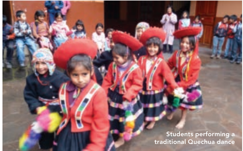
Students performing a traditional Quechua dance