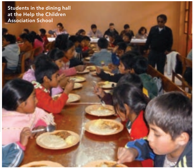
Students in the dining hall at the Help the Children Association School