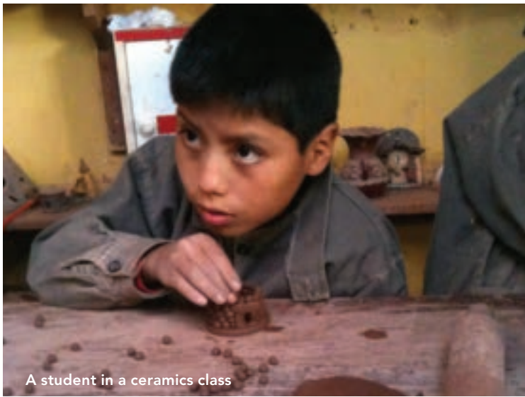
A student in a ceramics class