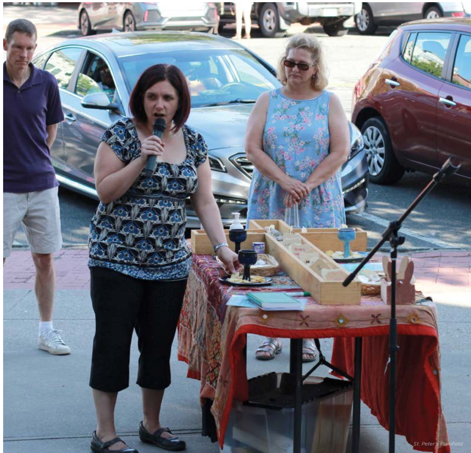
St. Peter's Plainfield