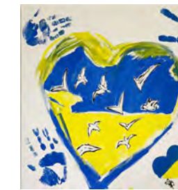
This art, painted by Ukrainian refugees during an art therapy program to help process their trauma, hangs at a Lutheran guest house in Romania that hosts about 20 Ukrainian refugees.