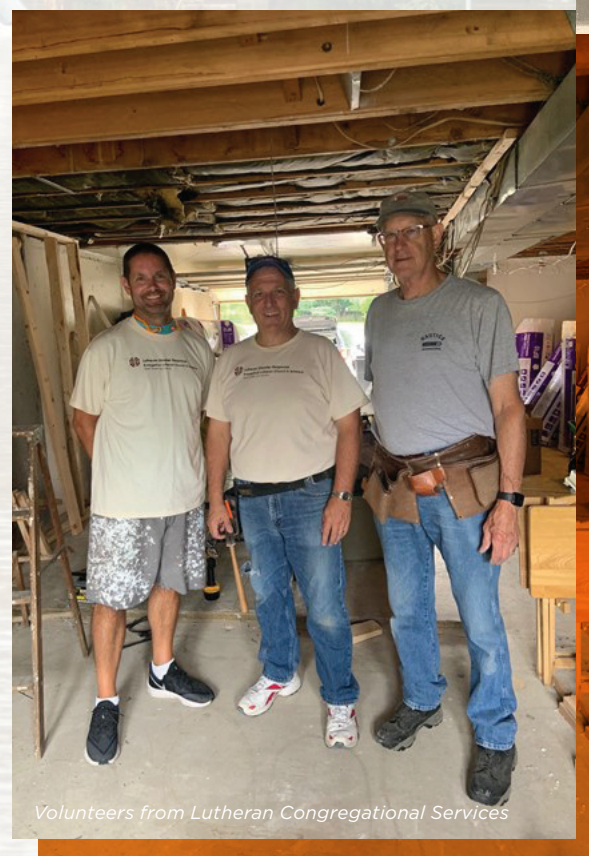
Volunteers from Lutheran Congregational Services