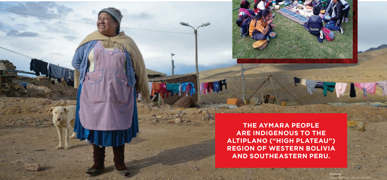
Bolivia