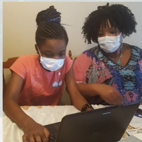
Christ Kiswahili Lutheran Mission supported new refugees in Nashville, Tenn., as they transitioned to distance learning in 2020. They include the first high school graduates in their community.

Since 2012, Christ Kiswahili Lutheran Mission (CKLM) in Nashville, Tenn., has served the growing population of Kiswahili-speaking refugees resettling in middle Tennessee from countries primarily in eastern Africa. As the COVID-19 pandemic closed schools and colleges everywhere, CKLM had to shift how they served their community, especially new refugees.