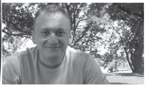
"And God is able to provide you with every blessing in abundance, so that by always having enough of everything, you may share abundantly in every good work."