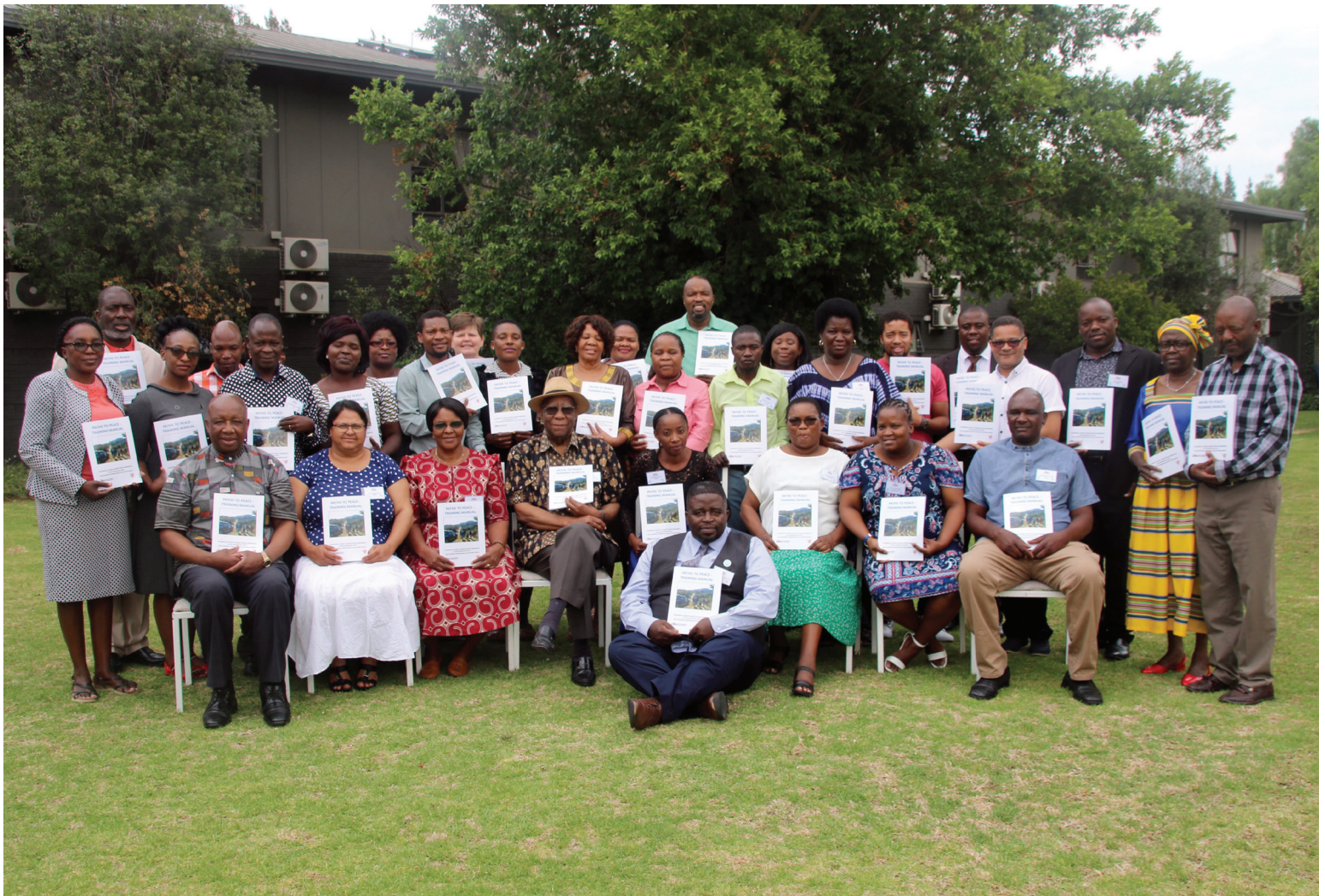
The LUCSA/ECLF training manual Paths to Peace was officially launched on Nov. 8, 2019.