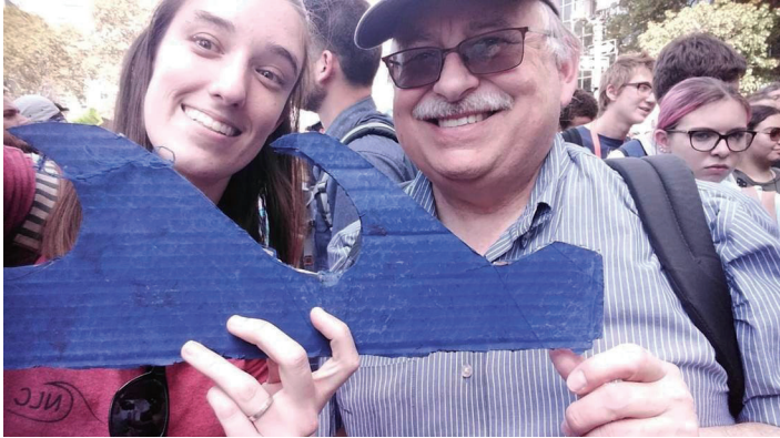
LOWC staff joined an estimated 60,000 students, adults and activists at the Global Climate Strike.