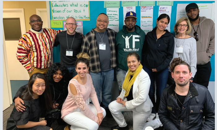
West coast regional gathering of the Glocal Musician Educators.