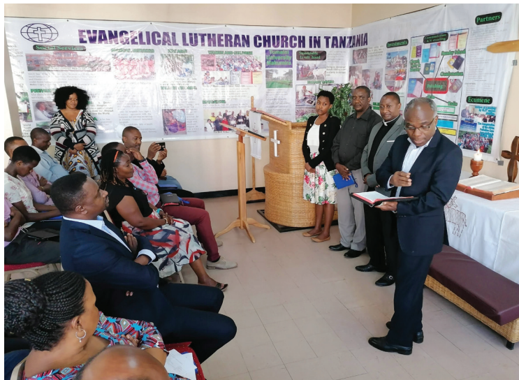
Ceremony at the Evangelical Lutheran Church in Tanzania Health Department.