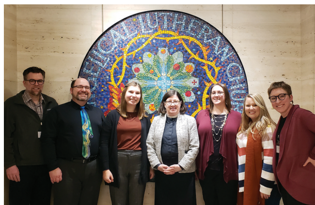
Six new missionaries with Presiding Bishop Elizabeth A. Eaton (center) at the New Mission Personnel Orientation in February 2020.

As we look forward to global service, we hope to fill approximately 35 missionary positions in 2020. We continue to recruit for a variety of Global Mission positions for deployment in July, including: communications consultant – Kenya; coordinator for the Evangelical Lutheran Church Africa Mission – South Sudan; English-language educator positions; and seminary professor positions at various locations. An updated list of positions can be found at elca.atsondemand.com .