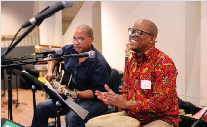
Glocal Musician Educators at the event "From Partnership to Mission: A Global and Local Journey," hosted by the Saint Paul Area Synod.

In November 2019, the Mission Formation team collaborated with the Glocal Musician Educators' community to create and articulate a new vision/mission for the Glocal ministry. Gatherings were held in Atlanta, Chicago, Minneapolis and San Francisco, during which attendees listened to and processed concerns and ideas from the Glocal Musician Educators while documenting insight, wisdom and thoughts to carry forward into the new year. The Mission Formation team and the Glocal Musician Educators look forward to partnering with you on your next transformative and experiential learning events!