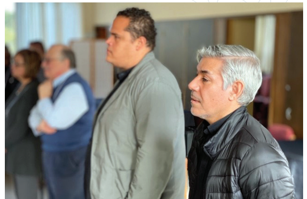
A sanctuary consultation in the Metropolitan New York Synod.

One of the actions of the sanctuary memorial adopted at the Churchwide Assembly was a request that the ELCA Church Council provide guidance around sanctuary for all three expressions of the ELCA. A process has been developed to enter into a listening period in which ELCA congregations, synods and members can provide suggestions about the guidance that would be most helpful from each of the three expressions of the ELCA. There may also be an opportunity to comment at synod assemblies and other ELCA churchwide events this summer. To get the process underway, 30 people representing ELCA sanctuary synods, hosting congregations and churchwide staff gathered in Burlingame, Calif., in mid-January to offer input.