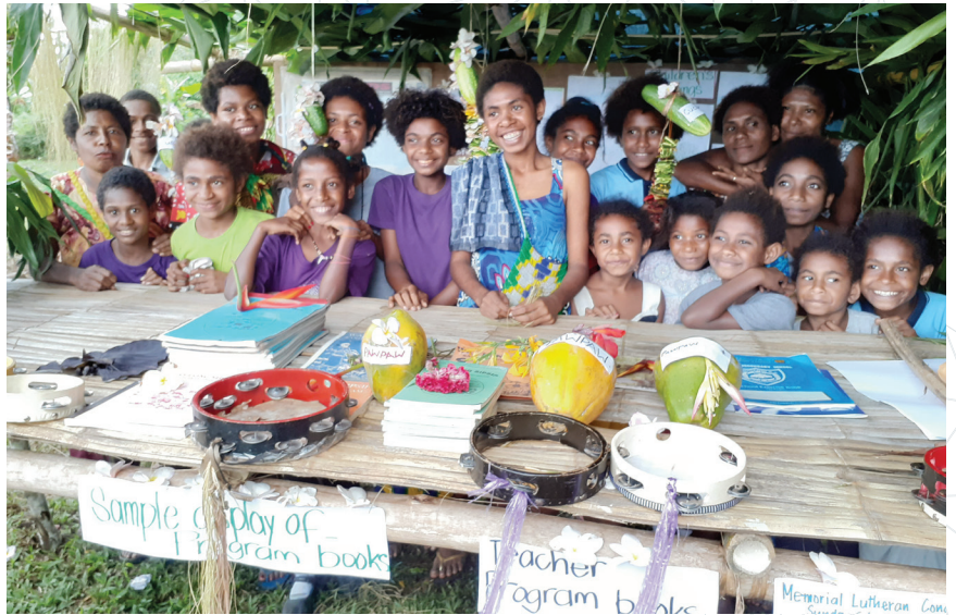
Sunday school materials on display at the Papua New Guinea Companion Synod Consultation.

The day after they arrived in Lae, they worshiped at St. Andrews, a local congregation. After worship they transitioned right into the consultation. Representatives of the ELCA synods and the four districts to which they relate (Papua, Niugini, Jabem and Kote), as well as other ELC-PNG leaders, met for two days. The meetings consisted of strategic conversations around accompaniment as it relates to the companion relationship, as well as updates, covenants, future planning and commitments.