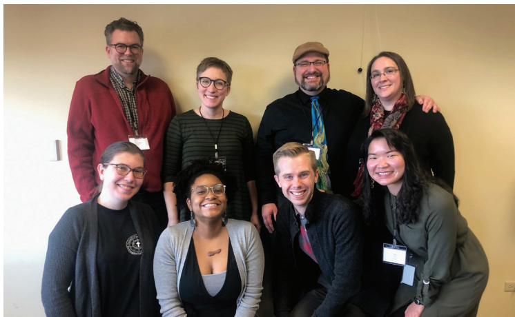
Former Young Adults in Global Mission share experiences with new country coordinators at winter orientation.