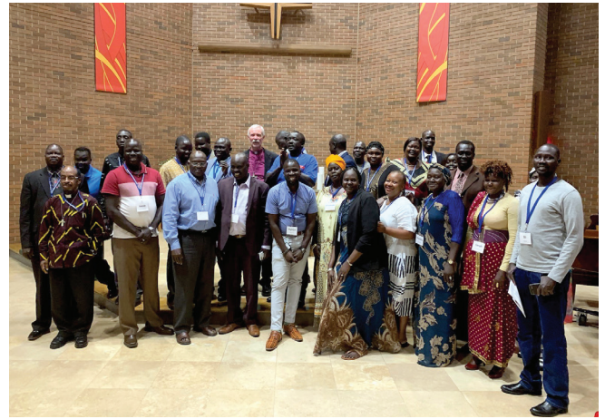
The South Sudan Network Gathering met in Rochester, Minn.