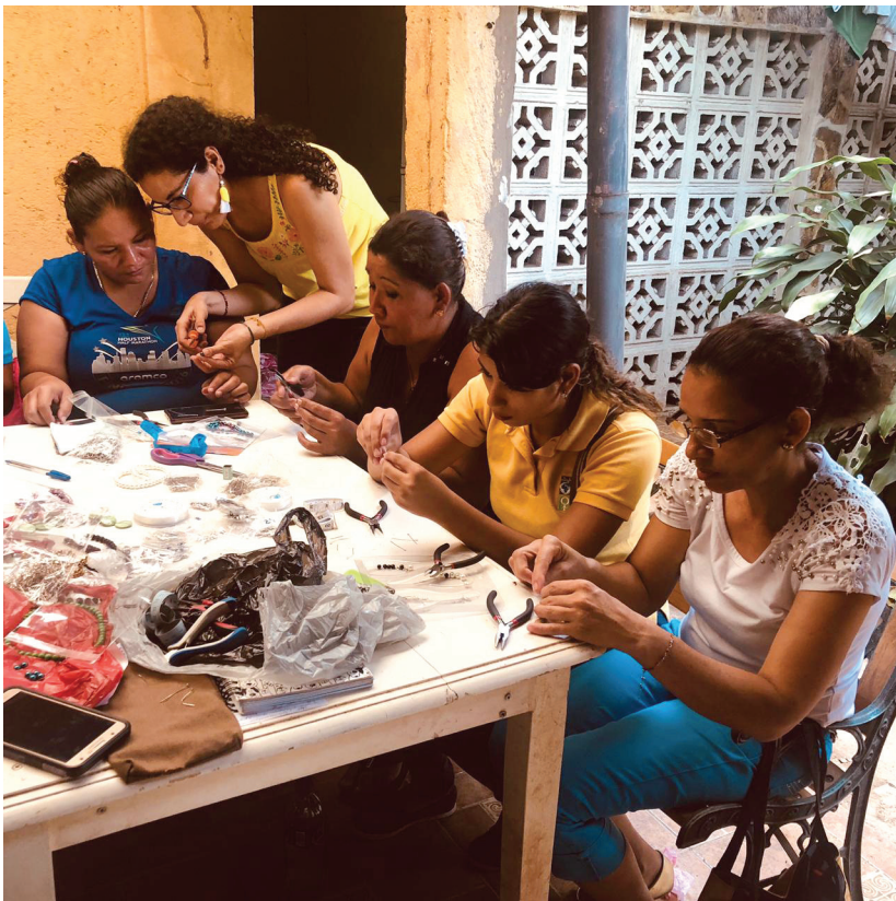
Women living with HIV create jewelry in a workshop in Masaya, Nicaragua. This is part of the women's empowerment project of the Nicaraguan Lutheran Church of Faith and Hope (ILFE).