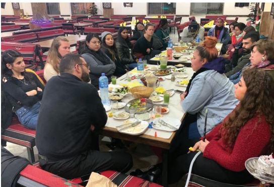
ELCA young adults attend a Peace Not Walls tour in the Holy Land.

In November 2019, a group of ELCA seminarians joined the second annual Peace Not Walls (PNW) Seminary Challenge, which invites seminarians to develop projects for use in ministry contexts that support the foci of the PNW initiative: accompaniment, advocacy and awareness raising. The accepted submissions are from two groups of students from United Lutheran Seminary and Princeton Theological Seminary. One finalist will have the opportunity to present their project at the annual PNW Gathering, June 19-21, 2020, in Washington, D.C.