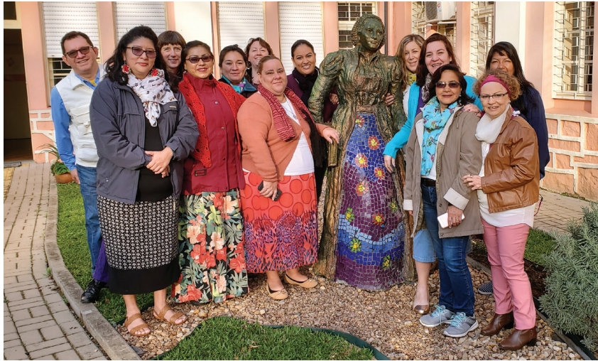
Participants in the sixth Latin American Congress on Gender and Religion.