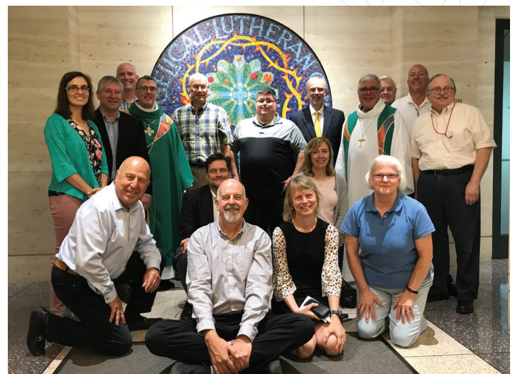
Gathering of the ELCA Network of the Evangelical Lutheran Church in Jordan and the Holy Land.