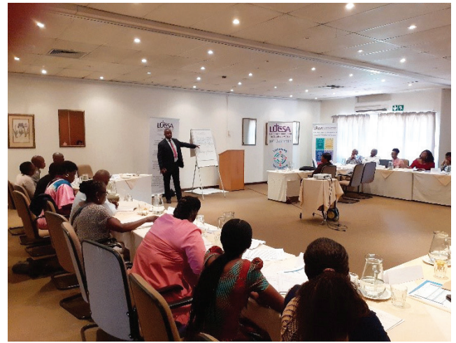
The Ecumenical Church Leaders Forum (ECLF) in Zimbabwe conducts a training through the Lutheran Communion in Southern Africa (LUCSA).

For over 10 years, the ELCA's Global Mission unit has been supporting the initiatives and work of the Ecumenical Church Leaders Forum (ECLF), which educates trainers in conflict resolution and peace-building in Zimbabwe and more recently expanded this collaboration with other companion churches in southern African countries. In November 2019, 15 member churches of the Lutheran Communion in Southern Africa (LUCSA) each sent two representatives, one male and one female, who were trained and thereafter authorized and supported by their respective churches to conduct workshops in conflict resolution and peacemaking. Thirty-six people participated, including eight trainers and three LUCSA communion office personnel. There were 18 female and 18 male participants.