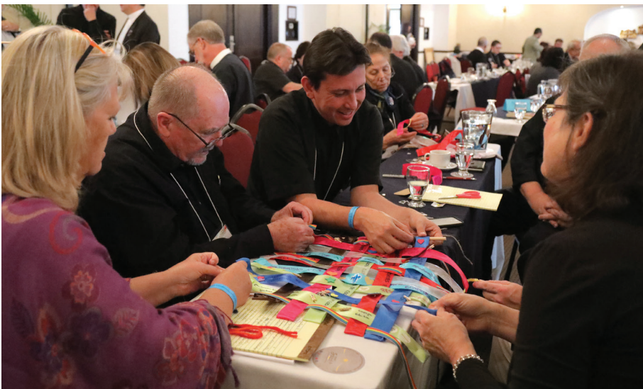
Representatives of the Evangelical Lutheran Church in Colombia, the South Carolina Synod (ELCA) and the Synod of Alberta and the Territories (ELCIC) take part in a weaving project and discuss what their joint work has meant to each church.