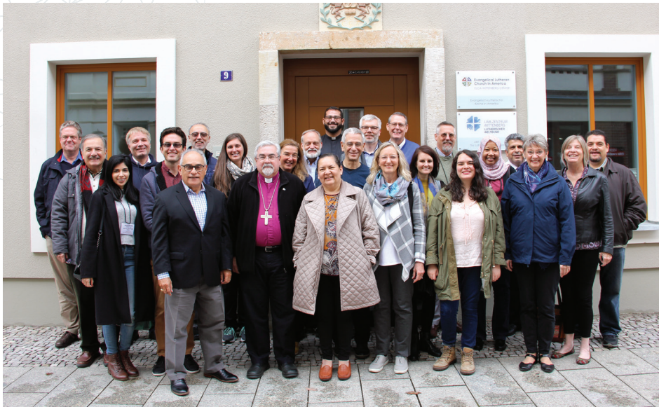
“Breaking Down Walls: Erasing Hostility” seminar in Wittenberg, Germany.