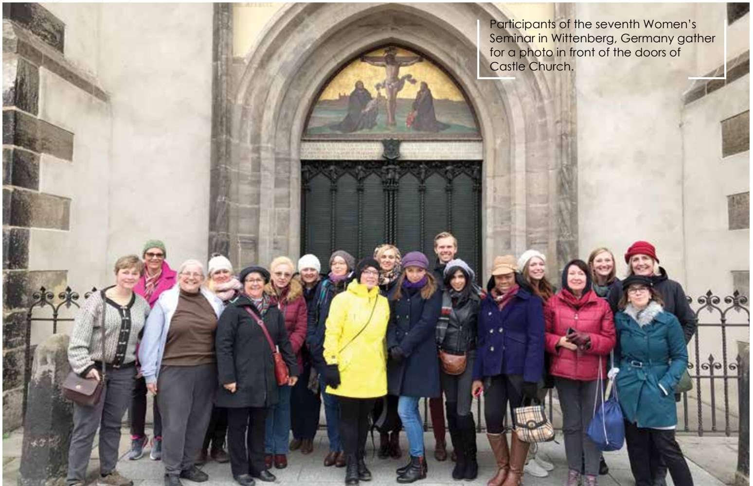
Participants of the seventh Women's Seminar in Wittenberg, Germany gather for a photo in front of the doors of Castle Church.