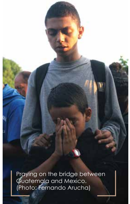
Praying on the bridge between Guatemala and Mexico.

In early October 2018, even before the first migrant caravan left Honduras, ELCA companions began to share information, news stories and photos about the coming exodus through the AMMPARO WhatsApp group. We asked for international accompaniment of these caravans, which include large numbers of mothers and children. Caravan members decided to travel together rather than make the trip alone because of the safety in numbers that the caravans offered.