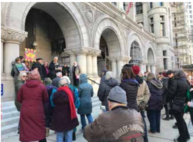
On International Migrant Day, Milwaukee Synod leaders bring their U.S. senators letters from 1,000 ELCA members pledging to stand with asylum seekers in Tijuana.

Several caravans left Honduras and El Salvador in late October and early November, crisscrossing Guatemala as other ELCA companions provided humanitarian aid and human rights accompaniment. Shortly after the first caravan left Honduras, the Comisión de Acción Social Menonita deployed staff to accompany the caravans continuously for over two months as they crossed into southern Mexico, made the long trek north and arrived at the northern border. Similarly, the Sinodo Luterano Salvadoreño deployed two members of its corps of youth reporters to accompany the caravan that departed San Salvador on October 31 and crossed into Mexico the first weekend of November.