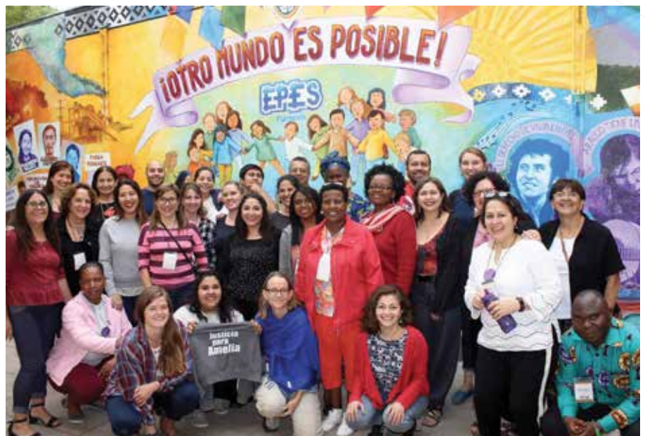
Group photo at the EPES central office in Santiago, Chile.

Over the past year, the Diakonia team has made it a priority to support companion churches and partners in increasing the impact of their programs through mutual sharing and socialization of knowledge among each other. Working with Global Mission and companion staff, the team has organized opportunities for churches to exchange stories, experiences, best practices, and lessons learned. Building organizational capacity in times of disaster was the objective of the emergency response training between Educacion Popular en Salud/ Popular Education in Health (EPES) in Chile and Servicio Ecumenico de Pastoral y Estudios de la Comunicación (SEPEC) in Peru focused on sharing expertise and experience around building organizational capacity in times of disaster; a school management training between companion churches in Bolivia ( Bolivian Lutheran Church -IELB ) and Argentina ( United Evangelical Lutheran Church- IELU ) focused on developing horizontal relationships and providing knowledge exchange to strengthen educational