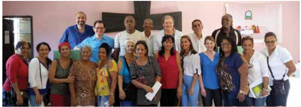
ELCA representatives with the IEU-SL congregation in Guantanamo and the emergency response committee of Guantanamo.

The United Evangelical Church – Lutheran Synod in Cuba (IEU-SL) is one of the newest members of the Lutheran World Federation, having been accepted as a full communion partner during the meeting of its council in July 2018. Working to develop and deepen relationships with the church, the ELCA sent a group of five people to Cuba in November 2018 (one from ELCA Domestic Mission, two from ELCA Global Mission, and two from the UECCLS's companion synod, Florida-Bahamas ).