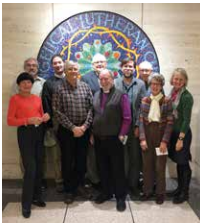
Members of the Russia Network gather in the lobby of the ELCA churchwide offices.