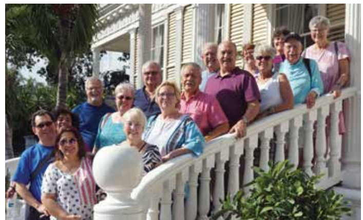
Group photo from immersion journey to Jamaica