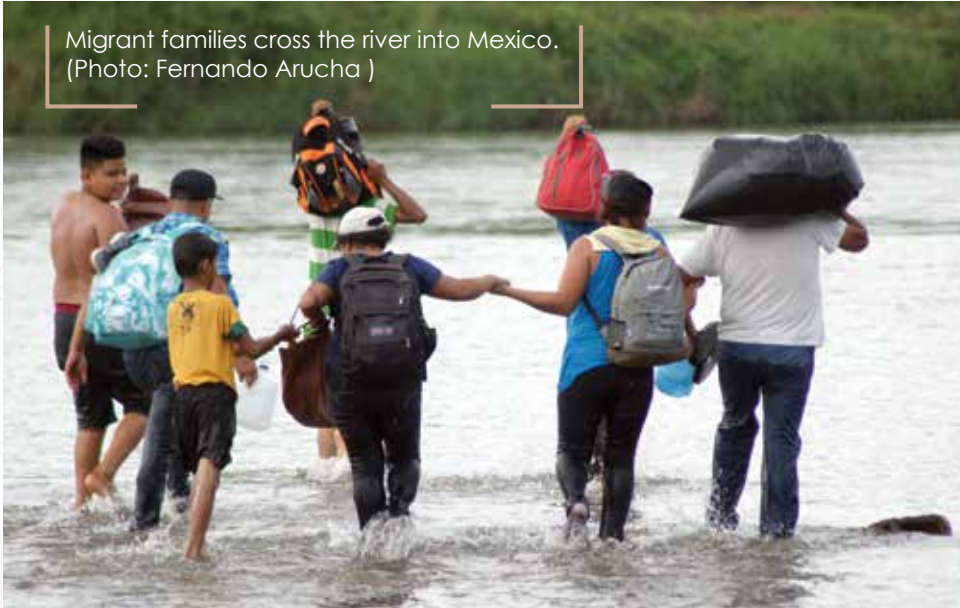
Migrant families cross the river into Mexico.

In early October 2018, even before the first migrant caravan left Honduras, ELCA companions began to share information, news stories and photos about the coming exodus through the AMMPARO WhatsApp group. We asked for international accompaniment of these caravans, which include large numbers of mothers and children. Caravan members decided to travel together rather than make the trip alone because of the safety in numbers that the caravans offered.