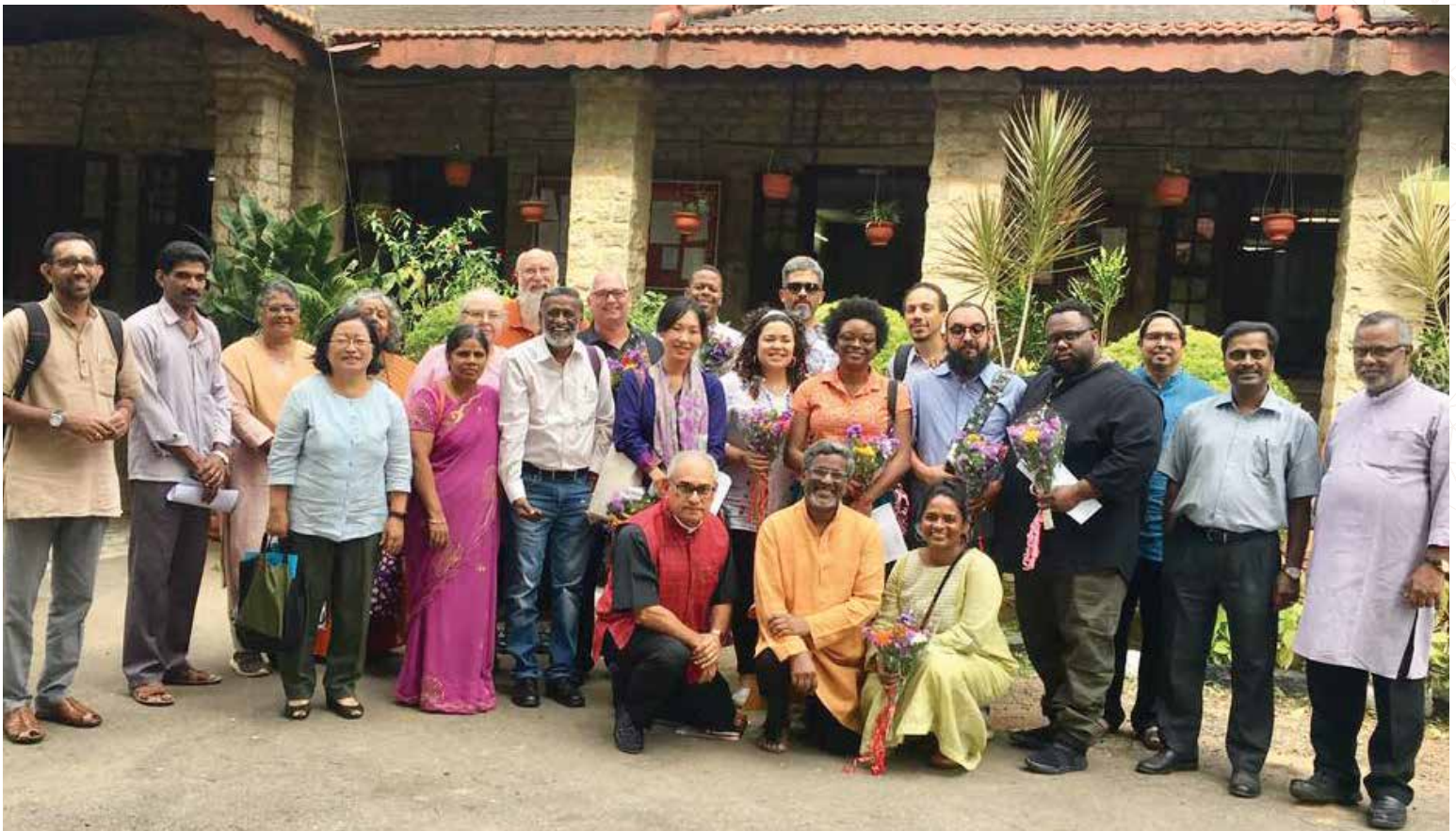
Glocal music educators, GM staff, and United Theological Seminary staff in Bangalore, India

We look forward to continuing these partnerships with our companions to engage and deepen our understanding and practice of mission, to collectively receive the gifts of the global church, and to share resources that leaders can take home to their respective ministries.