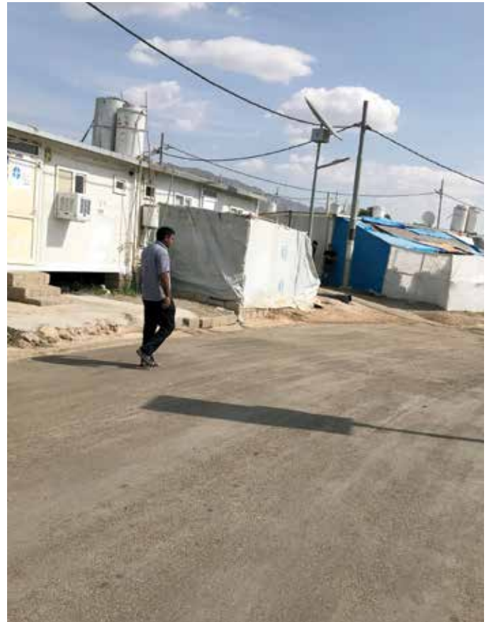
Dawudiya Camp, near Duhok, in northern Iraq, provides refuge for internally displaced persons (IDPs).

In Lebanon and Syria, we are looking into increasing our support for Syrian refugees and internally displaced people through the Middle East Council of Churches .