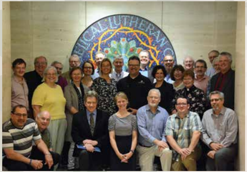
Attendees of the ELCA German Consultation.