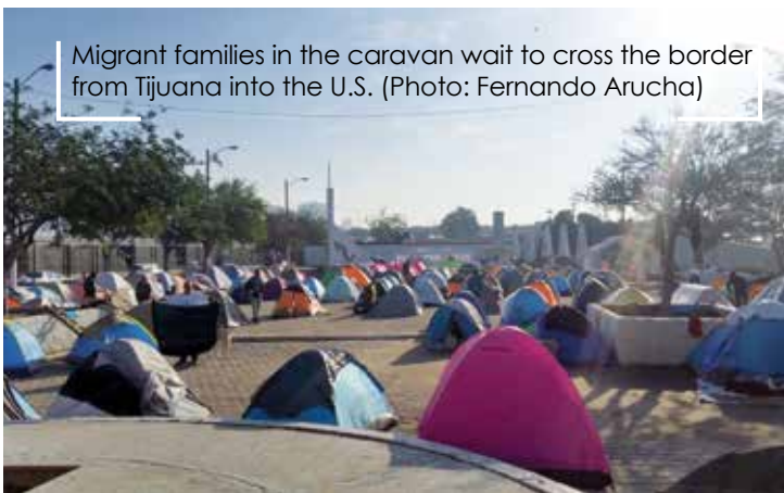
Migrant families in the caravan wait to cross the border from Tijuana into the U.S.

Though the caravans had originally planned to divide into smaller groups at the U.S. border, dangerous gangs and cartels in Mexican cities near the Texas ports of entry made it necessary for the caravans to go instead to Tijuana. Tijuana has a long history of receiving migrants and guarantees them a greater degree of safety. As thousands of migrants arrived in Tijuana, the U.S. government reacted by putting in place an illegal numbering system by which only 10 to 50 migrants have been allowed to cross the border each day. Thousands have camped out near the border wall for weeks on end. When an ELCA delegation talked with these families before Christmas, they shared their desperation and sense of being stuck indefinitely with meager resources. Many are living in tents, which flood when it rains.