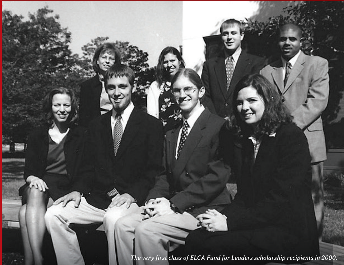
The very first class of ELCA Fund for Leaders scholarship recipients in 2000.