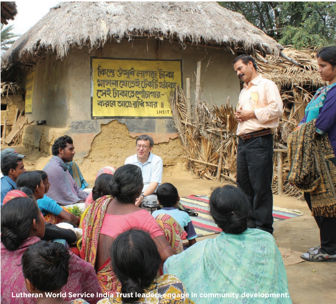
Lutheran World Service India Trust leaders engage in community development.