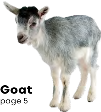
Goat page 5

Online ELCA.org/goodgifts Phone 800-638-3522 Mail Send the enclosed order form to: Evangelical Lutheran Church in America P.O. Box 1809 Merrifield, VA 22116-8009