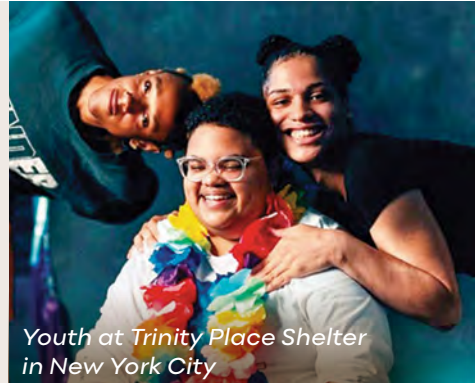
Youth at Trinity Place Shelter in New York City