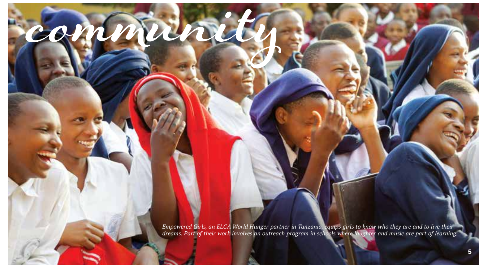
Empowered Girls, an ELCA World Hunger partner in Tanzania, equips girls to know who they are and to live their dreams. Part of their work involves an outreach program in schools where laughter and music are part of learning.

Your gifts to ELCA World Hunger fund innovative projects such as these that give the church new models for those in transition from being unhoused. These new programs don't just provide immediate impacts – they also create models for other congregations looking to innovate.