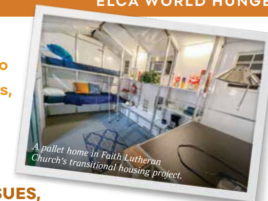
A pallet home in Faith Lutheran Church's transitional housing project.

Through your gifts to ELCA World Hunger, you have helped to fight hunger through projects in 25 U.S. states and territories, as well as reduce and prevent hunger in over 60 countries.