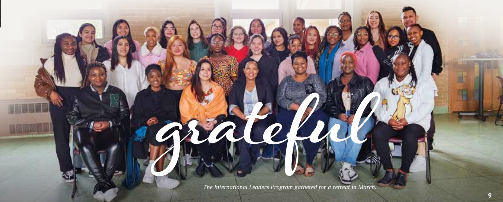
The International Leaders Program gathered for a retreat in March.