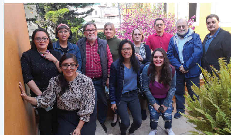
Dec. 10 encounter in Mexico City between AMMPARO delegates and key members of Grupo de Trabajo Sobre Política Migratoria (GTPM).

This spring, eight IWL scholars will earn their bachelor's degrees, joining an extensive alum community who are leading across all sectors of the global Lutheran community. For a video recording of our International Women's Day panel on March 8, visit ELCA.org/LeadershipCircle .