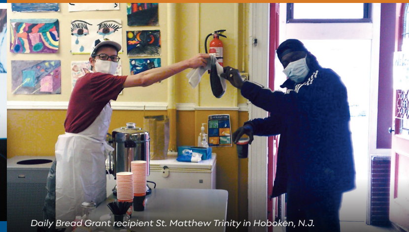
Daily Bread Grant recipient St. Matthew Trinity in Hoboken, N.J.