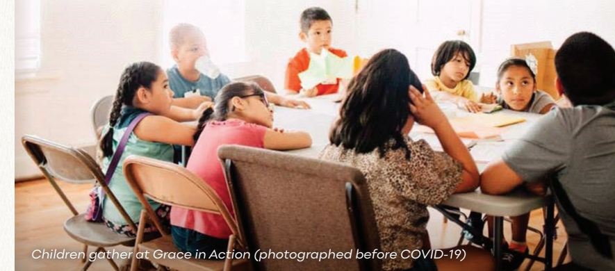
Children gather at Grace in Action (photographed before COVID-19)