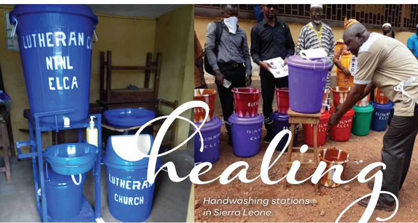
Handwashing stations in Sierra Leone