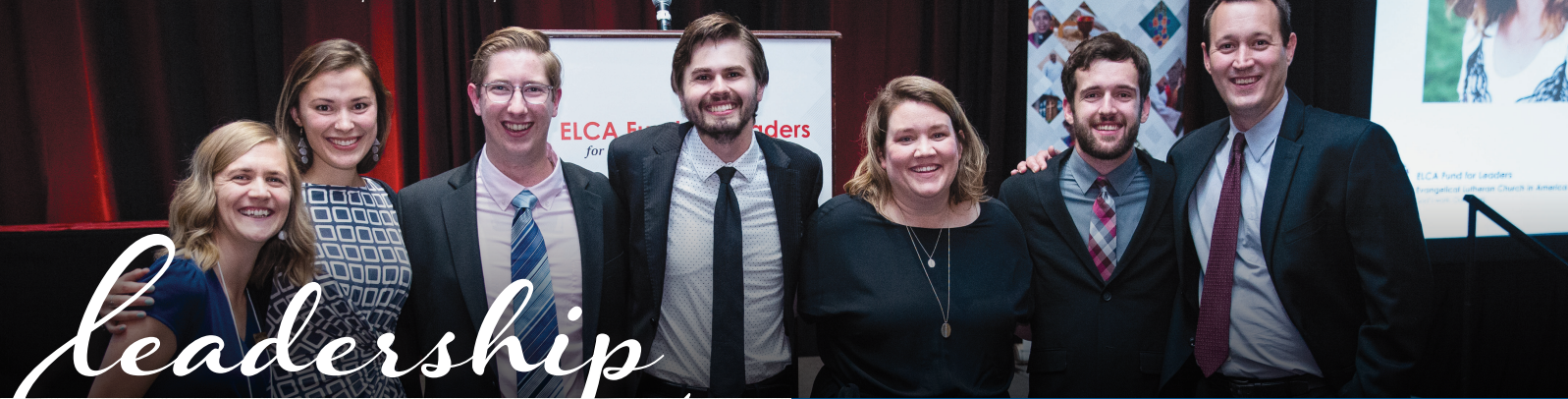
2019 ELCA Fund for Leaders Scholarship Awards Banquet