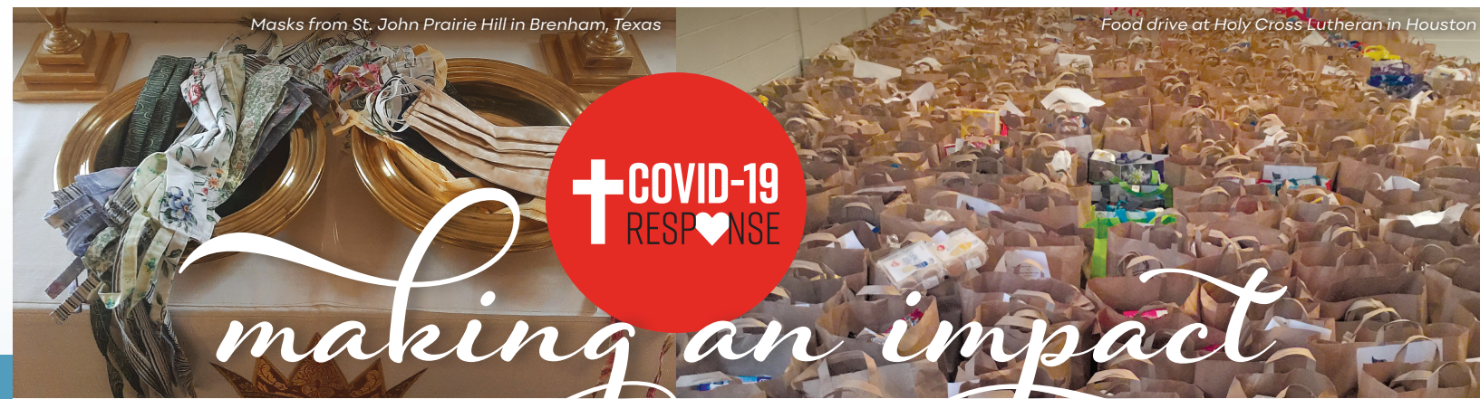
Masks from St. John Prairie Hill in Brenham, Texas

Your gifts are helping to assure your neighbors impacted by disaster that, even in the chaos of a global pandemic, they have not been forgotten. Thank you for your continuing dedication to this work.